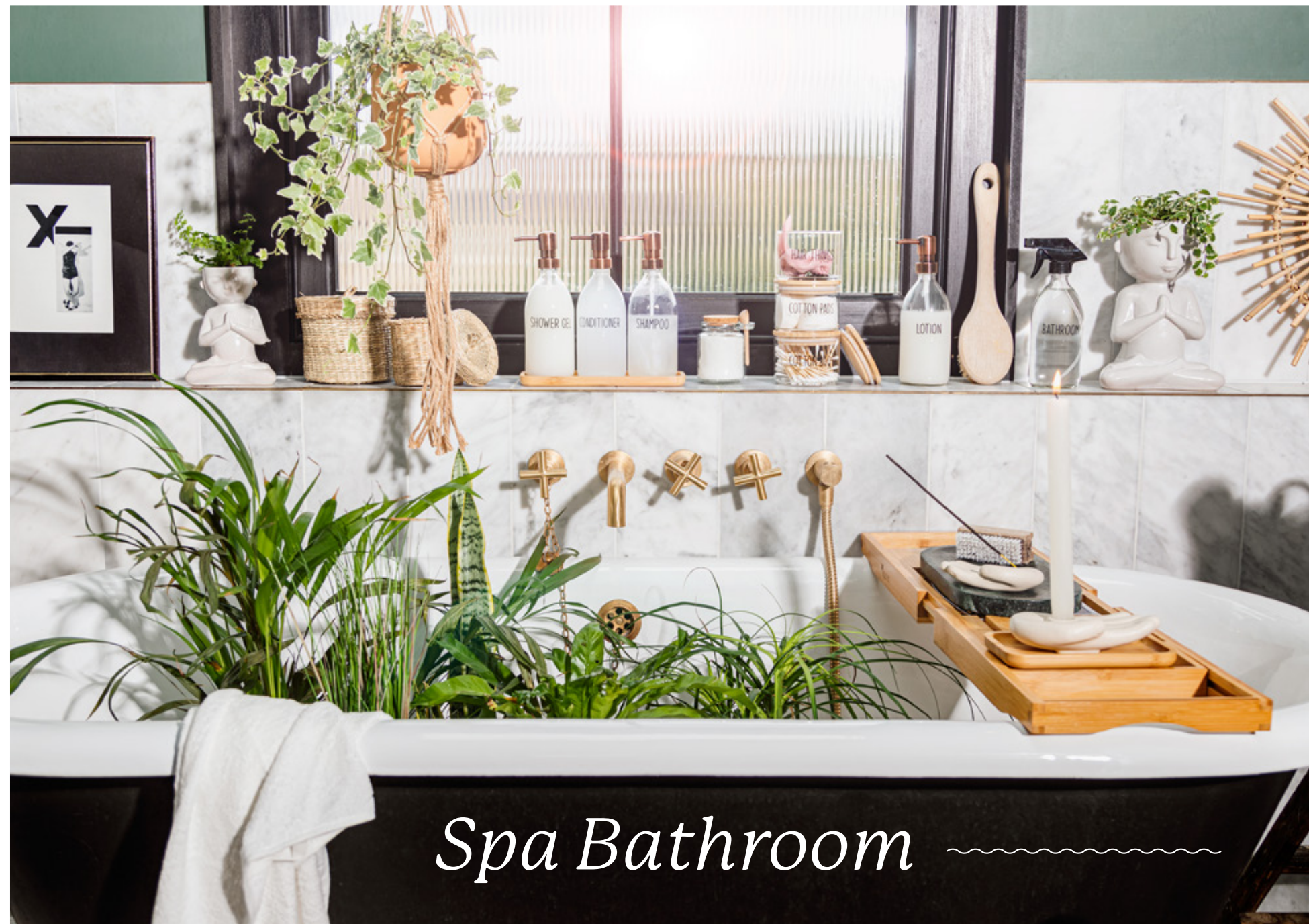
Spa Bathroom ~~~~~